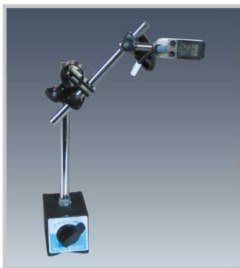
Middle Mold Detector

Vacuum Device. (Vacuum generator, magnetic valve and standard vacuum tool.)